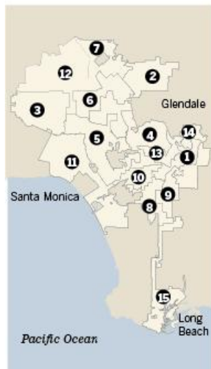
City Council districts

Note: Includes city parks, Angeles National Forest and Santa Monica Mountains National Recreation Area.