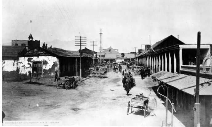
Calle de los Negros or "Nigger Alley" in Chinatown

In 1871, a mob that included police officers committed the lynching murders of nineteen Chinese residents at or near the site of Father Serra Park. The Chinatown Massacre first brought Los Angeles to national and international attention. The Massacre started on Calle de los Negros -- also known as "Nigger Alley" at the time -- on what is now Los Angeles Street between Union Station and the Chinese American Museum. See generally Pfaelzer, Driven Out: The Forgotten War against Chinese Americans , 47-56; Robert S. Greenwood, Down by the Station: Los Angeles Chinatown, 1880-1933 at 10-12, 37-40 (1996); Estrada, The Los Angeles Plaza: Sacred and Contested Space 73-78; Poole and Ball, El Pueblo: The Historic Heart of Los Angeles 33. The Chinatown Massacre reflects a pattern by which Chinese were driven out from communities throughout California in an "unrelenting confrontation with human cruelty." Patricia Nelson Limerick, Witnesses to Prosecution , N.Y. Times Sunday Book Review, July 29, 2007. See generally Pfaelzer, Driven Out: The Forgotten War against Chinese Americans .