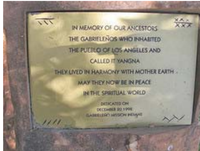
Yangna Plaque across from Father Serra Park at Union Station