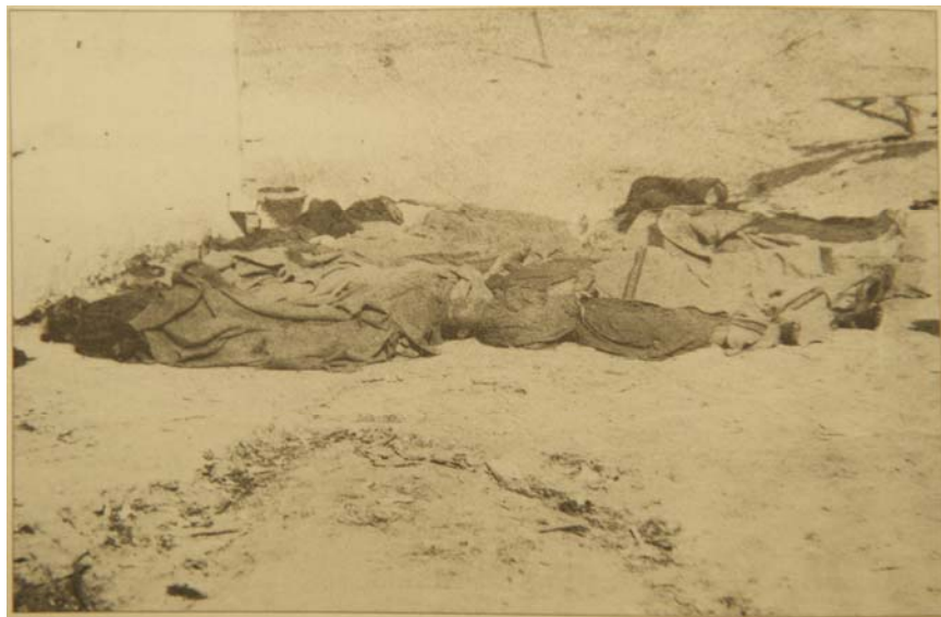
Victims of the Chinatown Massacre of 1871 lie dead in the jail yard.

In 1871, a mob that included police officers committed the lynching murders of nineteen Chinese residents at or near the site of Father Serra Park. The Chinatown Massacre first brought Los Angeles to national and international attention. The Massacre started on Calle de los Negros -- also known as "Nigger Alley" at the time -- on what is now Los Angeles Street between Union Station and the Chinese American Museum. See generally Pfaelzer, Driven Out: The Forgotten War against Chinese Americans , 47-56; Robert S. Greenwood, Down by the Station: Los Angeles Chinatown, 1880-1933 at 10-12, 37-40 (1996); Estrada, The Los Angeles Plaza: Sacred and Contested Space 73-78; Poole and Ball, El Pueblo: The Historic Heart of Los Angeles 33. The Chinatown Massacre reflects a pattern by which Chinese were driven out from communities throughout California in an "unrelenting confrontation with human cruelty." Patricia Nelson Limerick, Witnesses to Prosecution , N.Y. Times Sunday Book Review, July 29, 2007. See generally Pfaelzer, Driven Out: The Forgotten War against Chinese Americans .