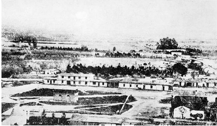
First photograph of Los Angeles shows the Lugo House across the Plaza at center left.