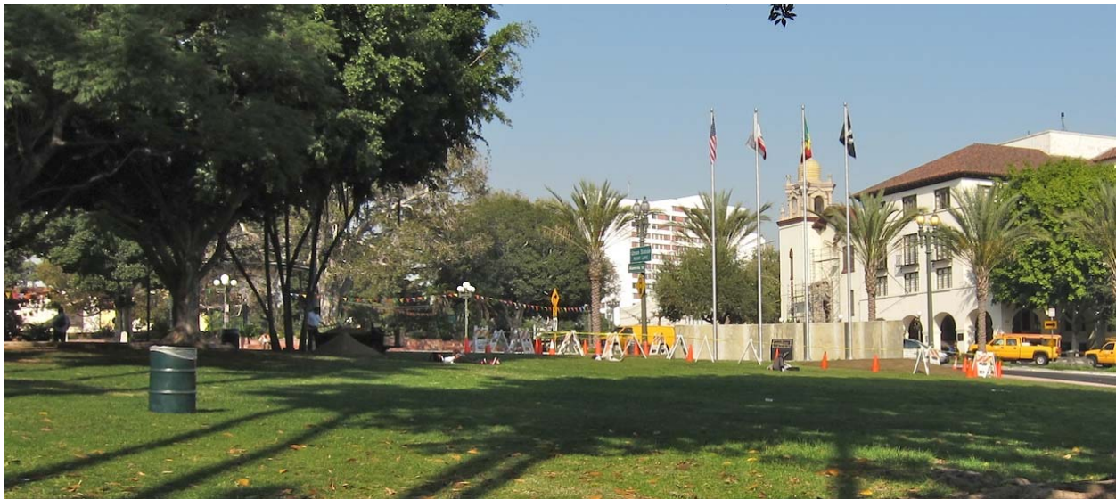
Father Serra Park in El Pueblo de Los Angeles Historic Monument showing the concrete Project wall under construction on November 19, 2009.

The proposed concrete, stone, brick and metal Project would devour priceless green space and be inconsistent with the history of Father Serra Park in the “most prestigious location . . . between Union Station and Olvera Street, within the historic and cultural heart of el Pueblo de Nuestra Señora de los Ángeles y Porciúncula, where our city was born,” according to the Project proponent. http://www.obregoncmh.org/mnmnt_siting/index.html . There are appropriate alternative sites for the Project at the Los Angeles National Veterans’ Park and National Veterans’ Cemetery, Fort Moore, Pershing Square, and the Veterans’ Regional and Community Park, as discussed above.