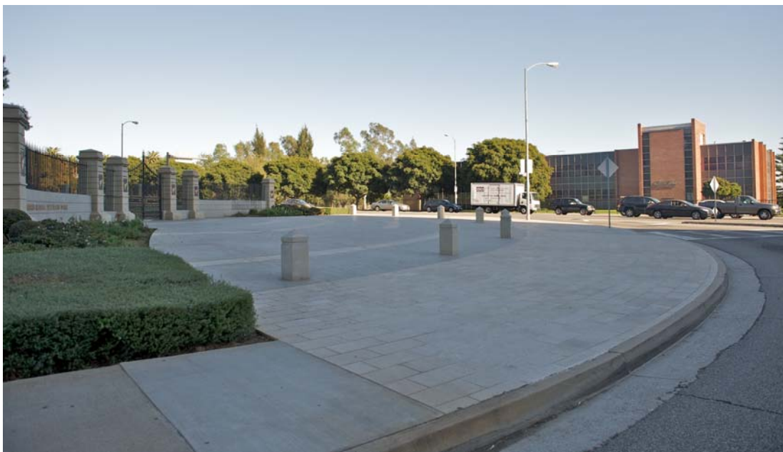
Western Gateway at the 16 acre Los Angeles National Veterans' Park and the 115 acre Veterans' National Cemetery on the mile long Veterans' Parkway on Wilshire Boulevard, across from the U.S. Army Reserve Center.